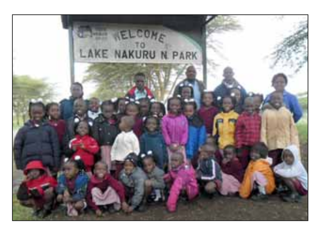
On their way home they took a little detour to visit the Nakuru national-park.

Ukunda. Here they visit grade 4 until 8. Furthermore, KiD is employing 10 Kenyan and is constantly providing work for local companies such as the constructing company, the painters who paint and maintain the building as well as local shops where food is purchased. Additionally to this, all of our school materials such as pen, pencil and books are purchased from local businesses. This is a lot, just now the new school year is being organized, 148 new uniforms are ordered, the shoes are too small, the sweatshirts too short and occasionally there are holes in one or another.