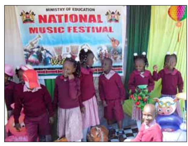
The kids dressing up for their performance. Especially the airls have dressed up with colourful pearls in their hair.

As you can tell, KiD has really grown in the last year. At this time, KiD is supporting 148 kids in total 50 of them in two kindergarden classes, 71 of them in three different school grades and another 27 kids visiting the neighbouring school in