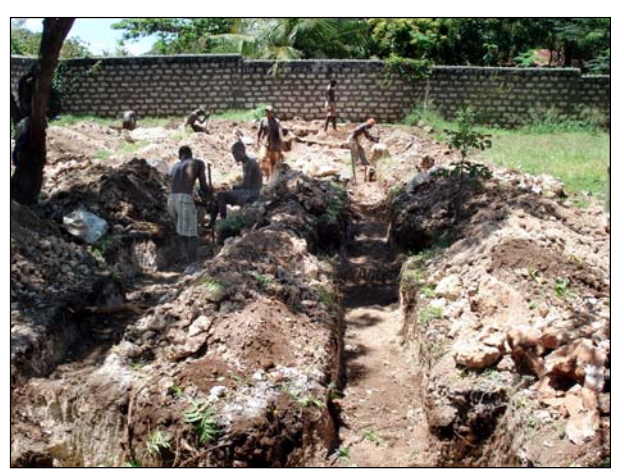
Joshua and some of the children standing on the site of the new building.