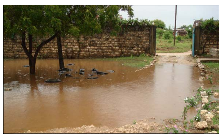
With cats and dogs raining all around them, the children gathered for meals under the roofs outside the classrooms. KiD teachers stood in front of the children to protect them further.

Speaking of eating, on some days it rained so heavily that the path to the kitchen/dining area became slippery, and teachers worried that children might fall carrying their plates. Instead, the children had their meals sitting outside, under the porch roof of the classrooms. Teachers wrapped themselves in raincoats and lined the chairs along the outer wall, then stood facing the children with their backs to the rain, to keep the children dry. It was inspiring to witness this level of dedication in our staff members!