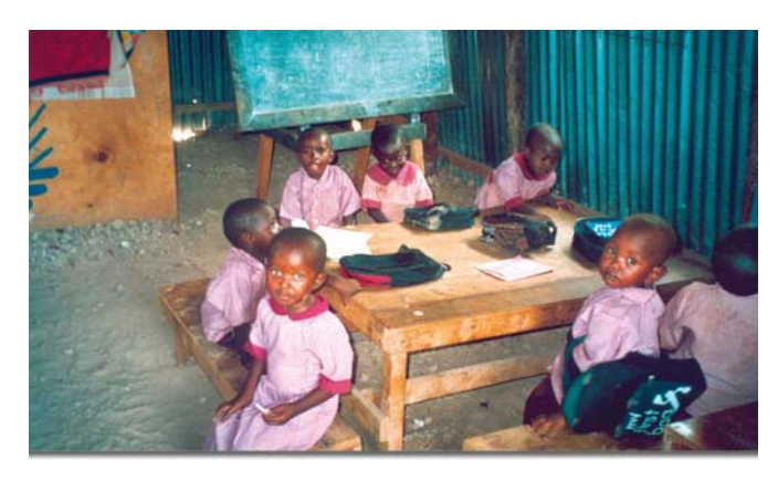
These seven children are new.

The seven "big ones" on the day of enrollment of the state school in Ukunda